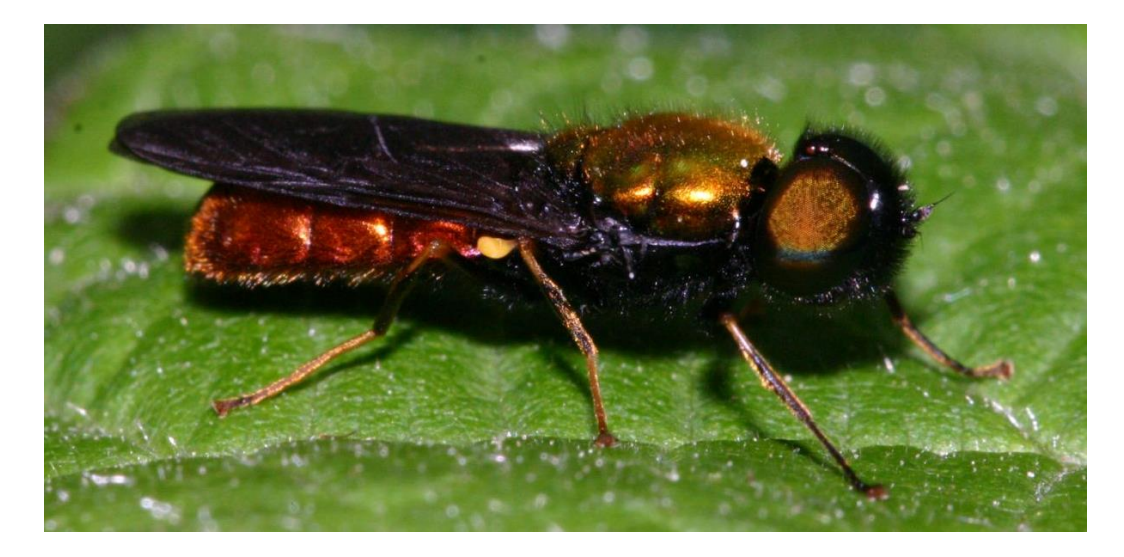
Photo of male C. speciosa showing the yellow mid and hind tarsi